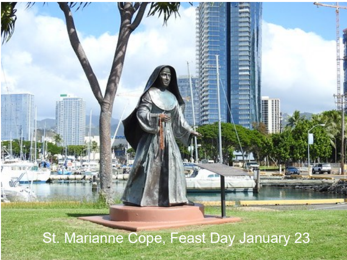
St. Marianne Cope, Feast Day January 23

January 28, 2024 | The Fourth Sunday in Ordinary Time