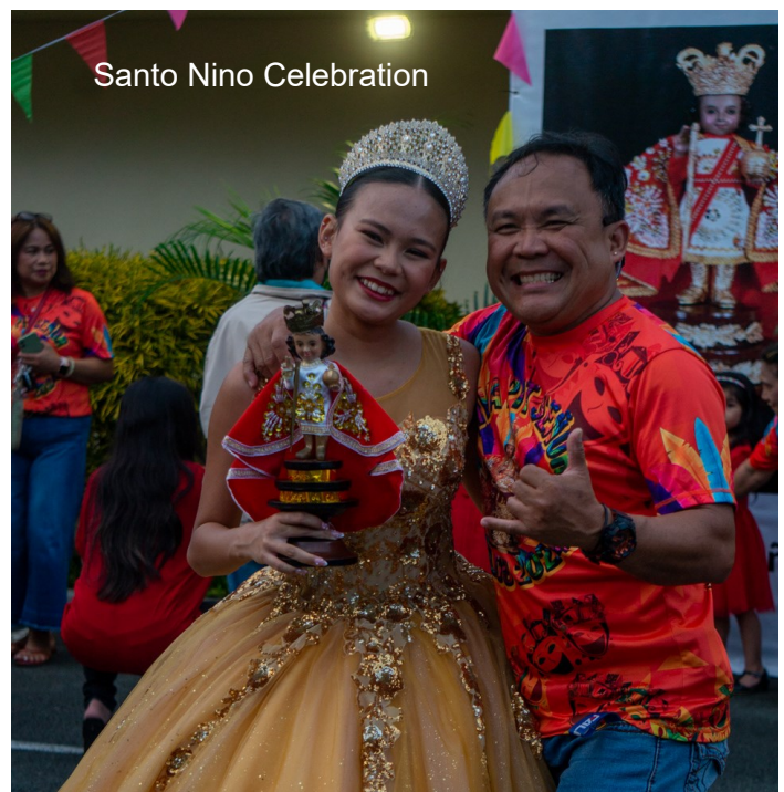
Santo Nino Celebration

Can I identify an unclean spirit in me that seeks to destroy me? Can I find the courage to ask God to free me from this demon?