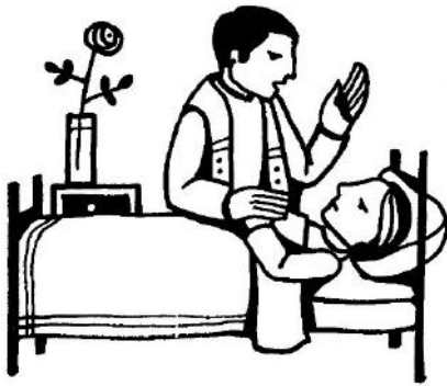
Anointing of the sick