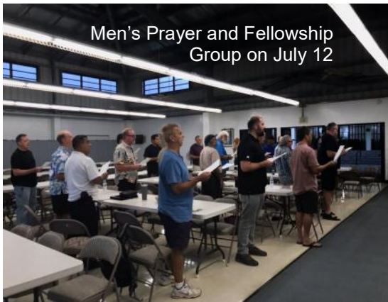
Men's Prayer and Fellowship Group on July 12

Hawaii needs more than 200 blood donors everyday. Please support the Bloodmobile which will be at St. George on Sunday, August 27, 2023 from 7 a.m. to 1 p.m.