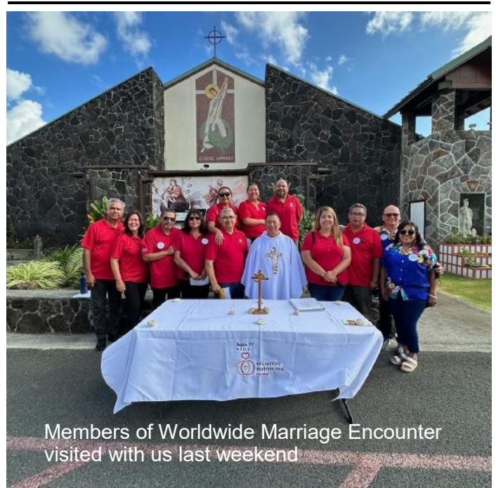
Members of Worldwide Marriage Encounter visited with us last weekend