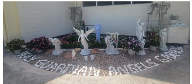
This garden will be dedicated on Monday, October 2.

12—6 p.m. Eucharistic Rosary Congress at St. George in the church